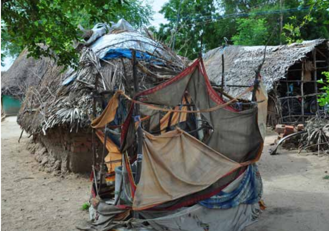
Migrant workers live under primitive conditions without appropriate sanitation or other municipal services

viewed the employer does not remunerate sick leave, and deducts the cost of medical care from the employees' wages. The contracted employees have no right to decline overtime, and occasionally they do 16 hour double shifts without breaks.