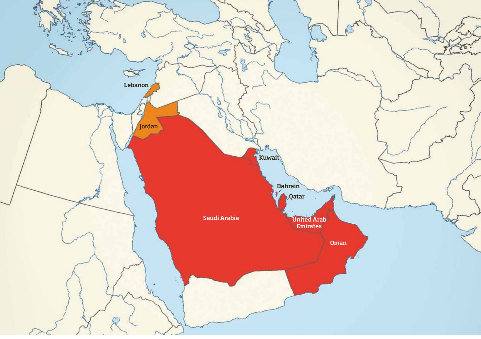
Kafala is used to govern labour migration in all GCC countries and for many migrant workers in Lebanon and Jordan. Although the systems are similar in many ways there are differences, in Qatar for instance the worker needs written permission from the sponsor in order to leave the country.