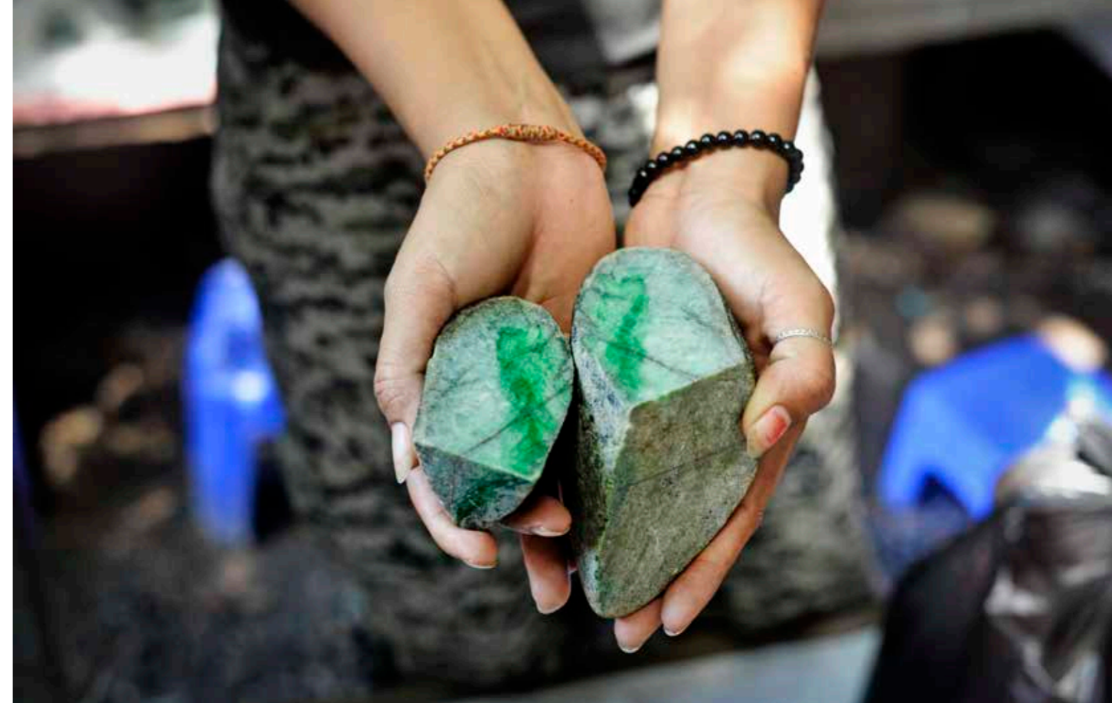
Jade comes in different colours, but most commonly in the shade of green. China is by far the largest market, where jade for centuries has been associated with royalty and prosperity. Today, jade is a status symbol among the wealthy. One kilo of jade can be sold for millions of dollars on foreign markets.

The intensity of fighting between the Myanmar military and the KIA in Kachin state has fluctuated for around 60 years, and reignited in 2011 after a 17-year ceasefire. 14 The fighting has led to the killing of thousands of people as well as waves of displacements, and it continues with regular bursts of intensity. Close to 100,000 persons live in the over 100 camps and other provisional sites for displaced civilians that are scattered throughout Kachin state. Many receive no humanitarian aid as the Myanmar government has not permitted the UN to access certain areas since 2016. For civilians