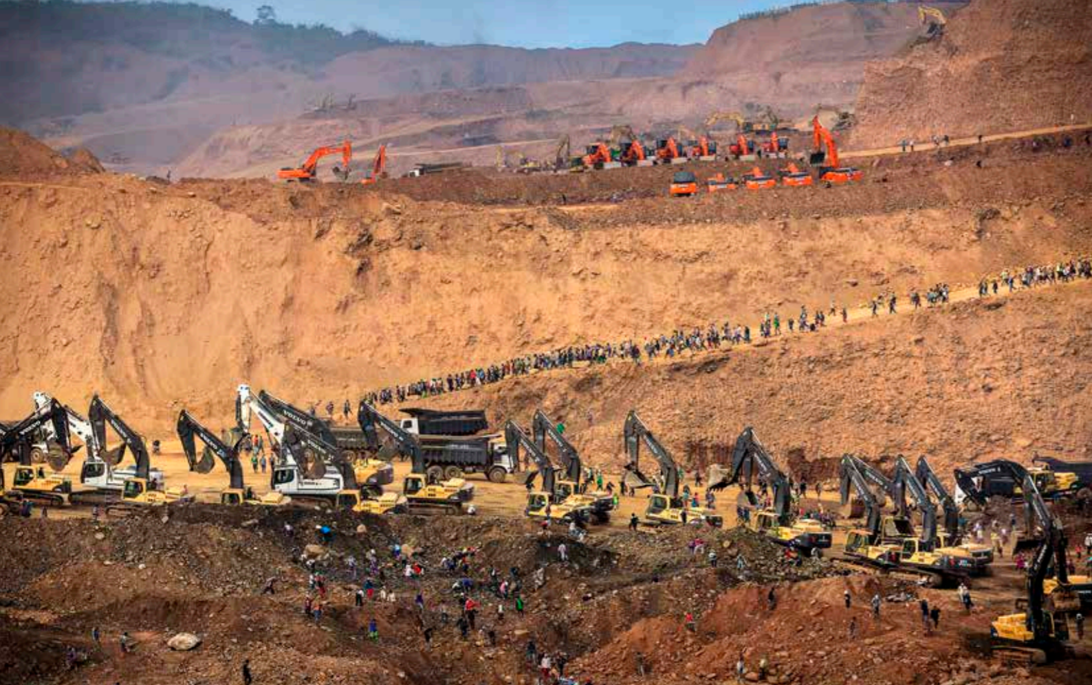
In addition to excavators and trucks by Volvo CE, Komatsu and Caterpillar, excavators by the mining machinery producers Liebherr-Mining and Doosan are operated in the jade mines, seen here in white and orange respectively.