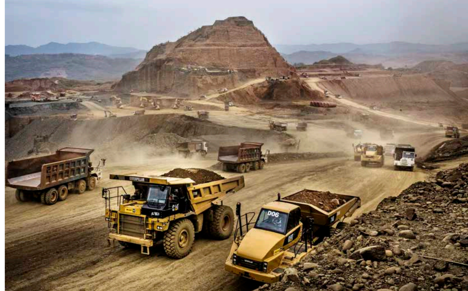
"It used to be green here. Now it looks like we live on the moon," local resident in Hpakant, interviewed by Swedwatch in 2017.

Caterpillar is not a member of the UN Global Compact. In its 2018 Environmental, Social and Governance Priorities & Approach, Caterpillar stated that its Human Rights Program is "informed by" the UNGPs and that the company will consider the use of on-the-ground human rights impact assessments in high-risk regions. It also states that Caterpillar is "committed to engaging in dialogue with external stakeholders to understand human rights-related issues and concerns". In Swedwatch's experience of two years of dialogue with Caterpillar this commitment is not convincing in terms of the quality of engagement; the company did reply to Swedwatch's emails,