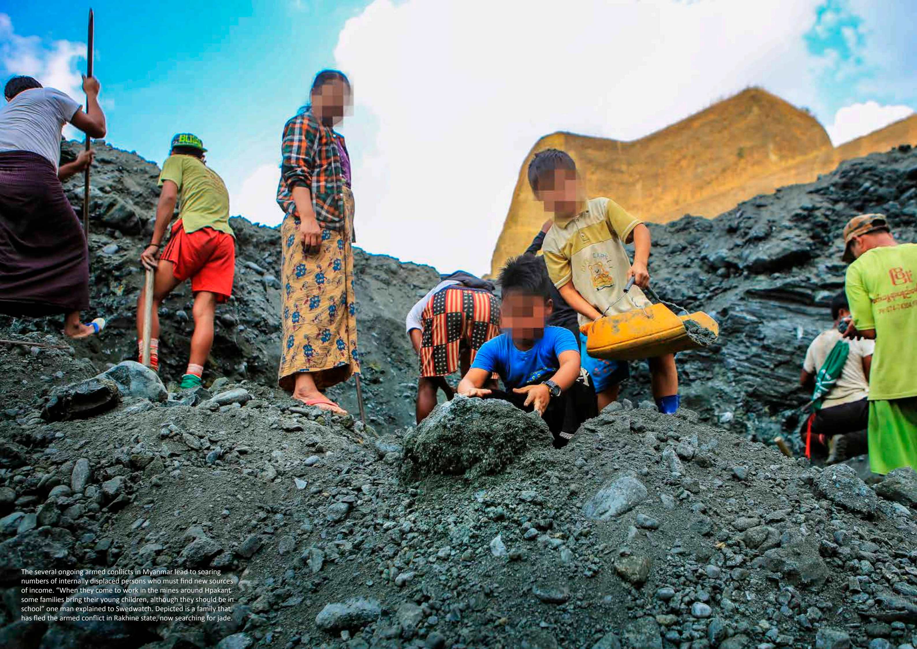
The several ongoing armed conflicts in Myanmar lead to soaring numbers of internally displaced persons who must find new sources of income. "When they come to work in the mines around Hpakant some families bring their young children, although they should be in school" one man explained to Swedwatch. Depicted is a family that has fled the armed conflict in Rakhine state, now searching for jade.