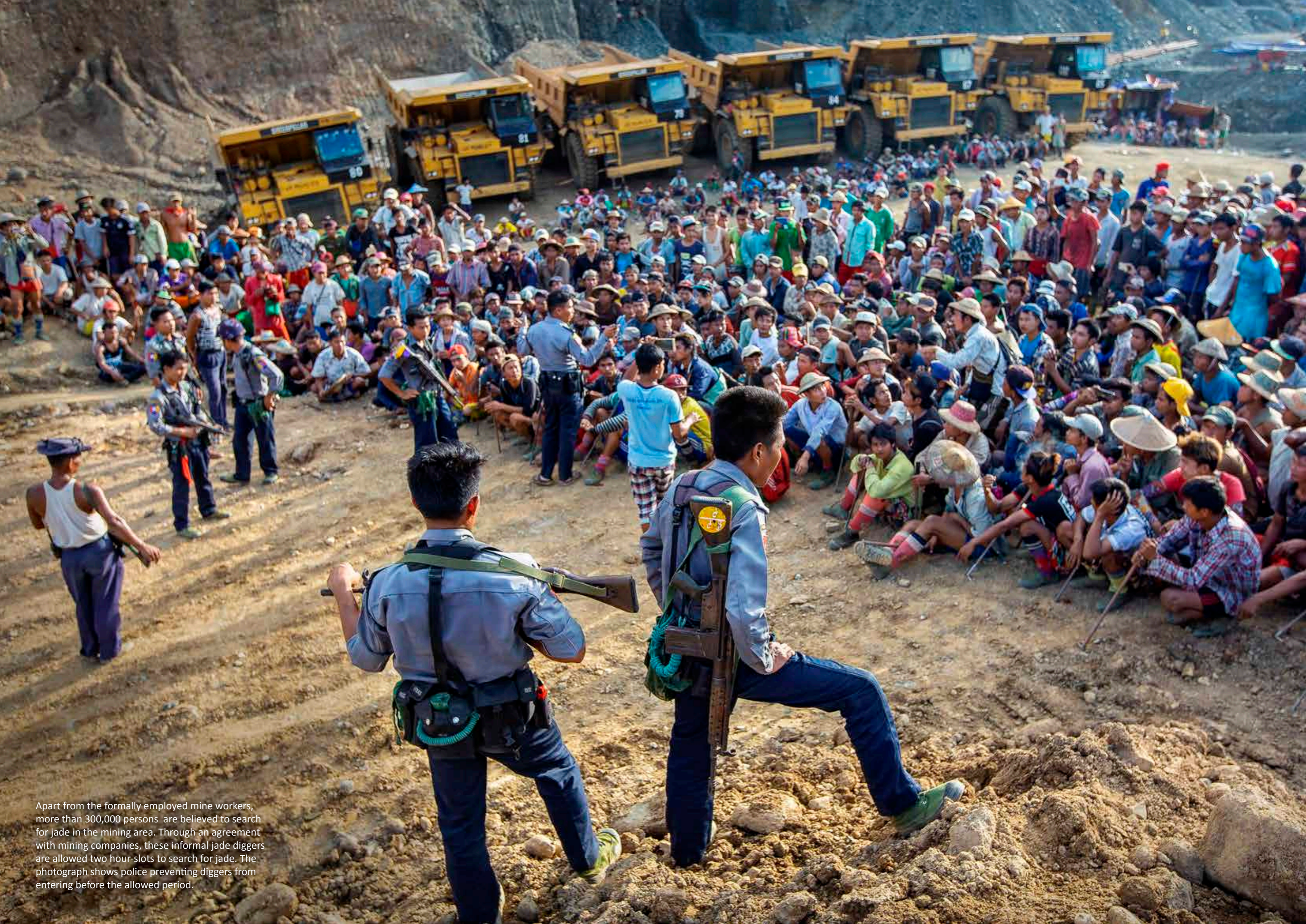
Apart from the formally employed mine workers, more than 300,000 persons are believed to search for jade in the mining area. Through an agreement with mining companies, these informal jade diggers are allowed two hour-slots to search for jade. The photograph shows police preventing diggers from entering before the allowed period.