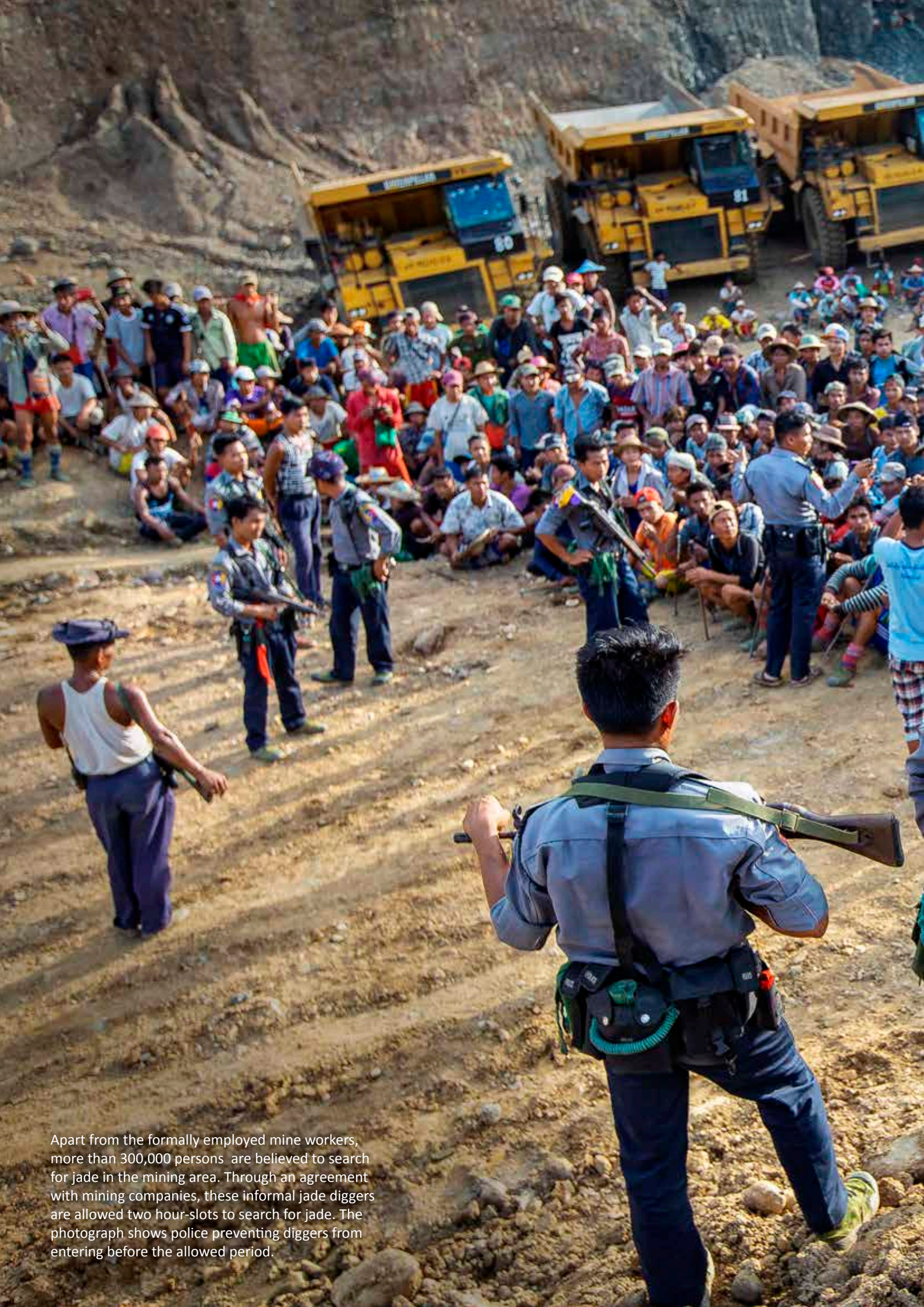
Apart from the formally employed mine workers, more than 300,000 persons are believed to search for jade in the mining area. Through an agreement with mining companies, these informal jade diggers are allowed two hour-slots to search for jade. The photograph shows police preventing diggers from entering before the allowed period.