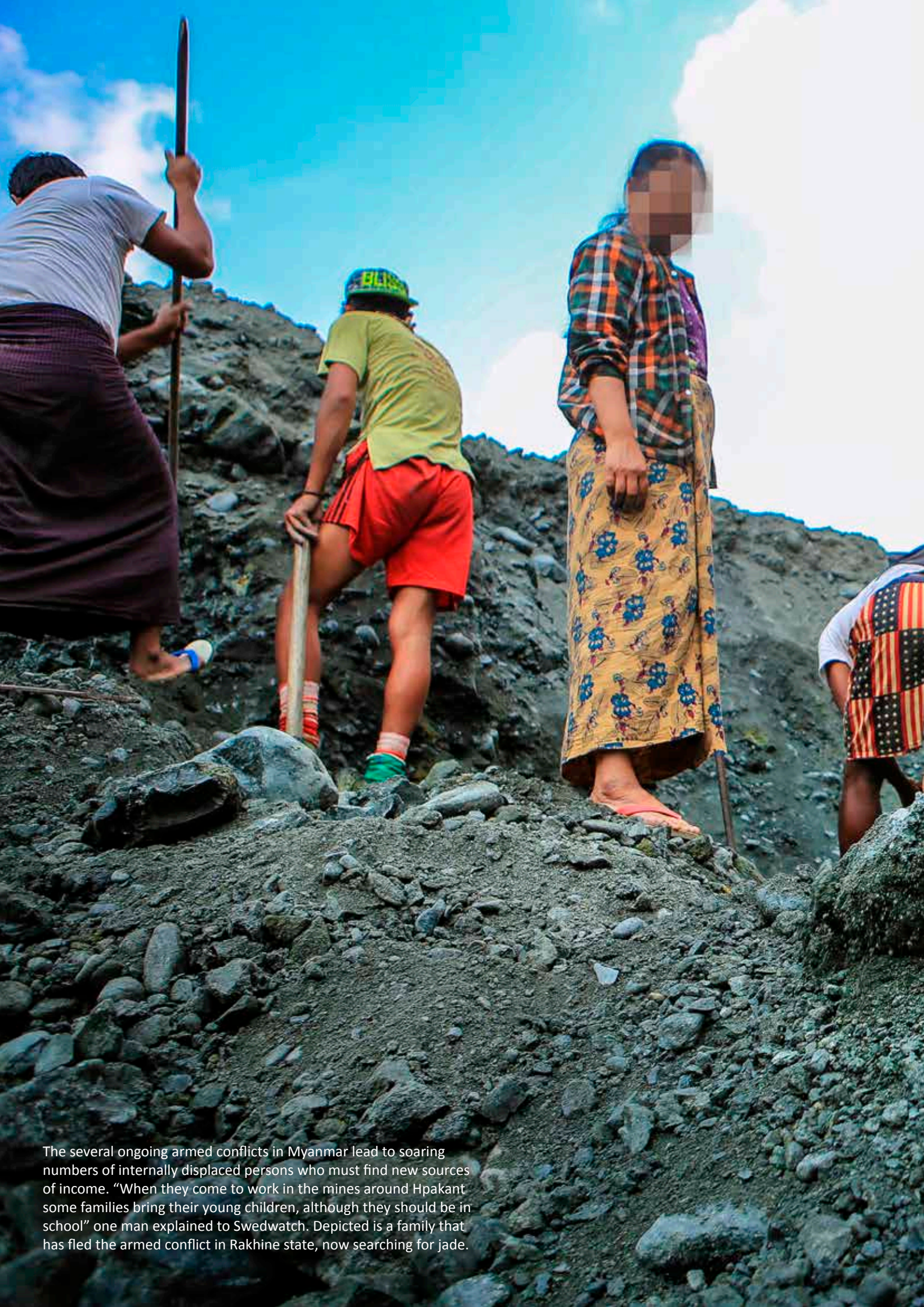
The several ongoing armed conflicts in Myanmar lead to soaring numbers of internally displaced persons who must find new sources of income. "When they come to work in the mines around Hpakan some families bring their young children, although they should be in school" one man explained to Swedwatch. Depicted is a family that has fled the armed conflict in Rakhine state, now searching for jade.